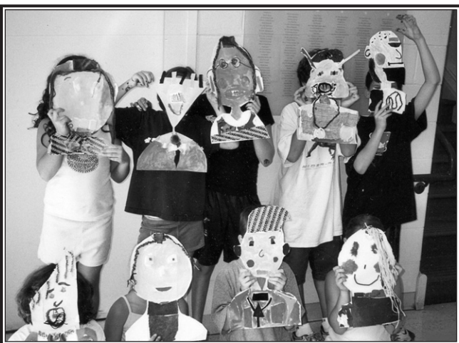
Students display their creative masks at Main Line Arts Center.